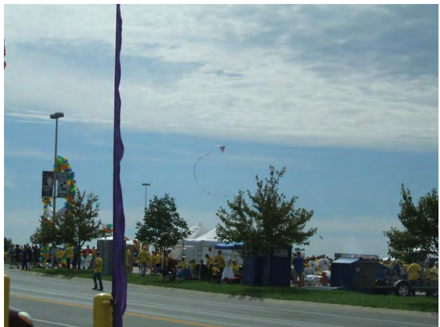
Steve Batliner flies in the skies over Step Up for Down Syndrome Walk.

Final figures are not tabulated yet, but this event had a goal to raise $400,000, and looked very close to making that goal with 270 teams of walkers with over 6467 people registered for the walk, not counting volunteers and support people.