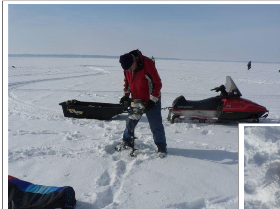
Large gas powered augers drill the pilot holes through the ice.

No ice exposed this year to slip on, all fresh snow covered. The colors are sharp and clear in the cold air against the white snow and ice.