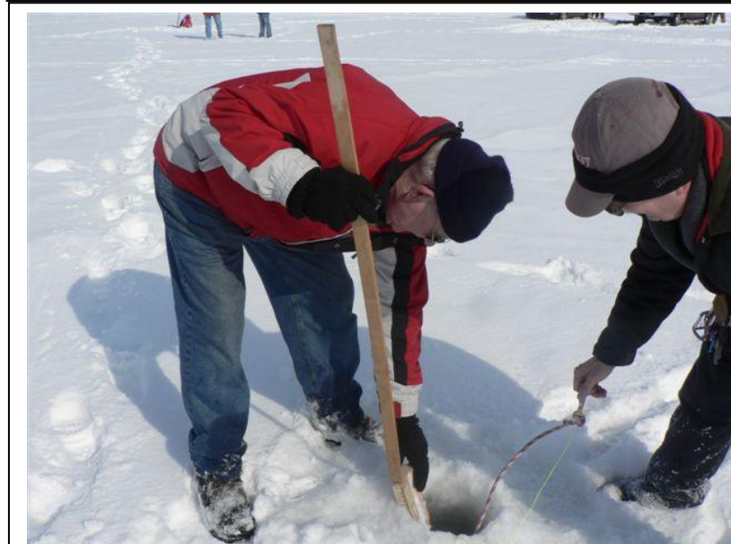
The wood anchor is poked down the hole with a "pusher" stick. Keep a grip on the rope! That big knot on the end will tie off the show kites.

use their power drills to auger pilot holes in the 26" ice. Once they are through, the kiter lowers a 4 foot 2x4 with a big rope attached (three foot) to anchor to. The 2x4 holds under the ice distributing the stress and pull of the big show kites. During the