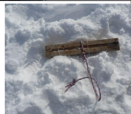
Anchors are 2x4's, about 3 feet long, with about 3 foot of heavy rope tied securely around the middle.

Very different too, how they anchor the kites. Larry has organized several ice fishermen who come out in the morning and