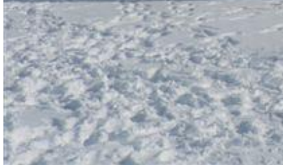
Clear Lake—Color the Wind 2010

Above, the Gilson's bol framing show kites.