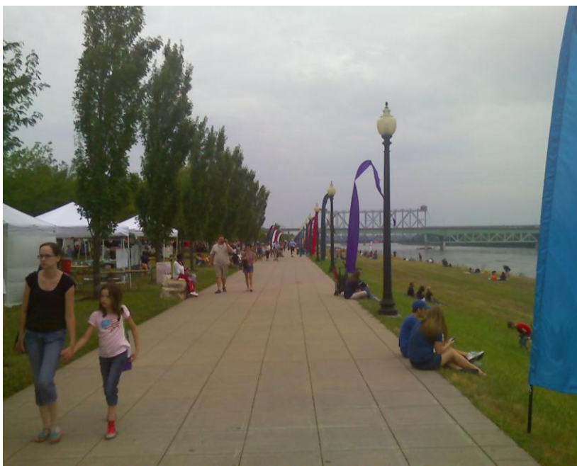
The Walkway at Riverfest early in the day.

Remember, it is weather and time dependent—whoever can make it will be there.