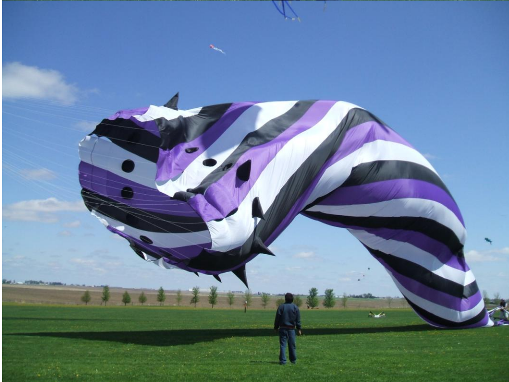
Kites Over Grinnell