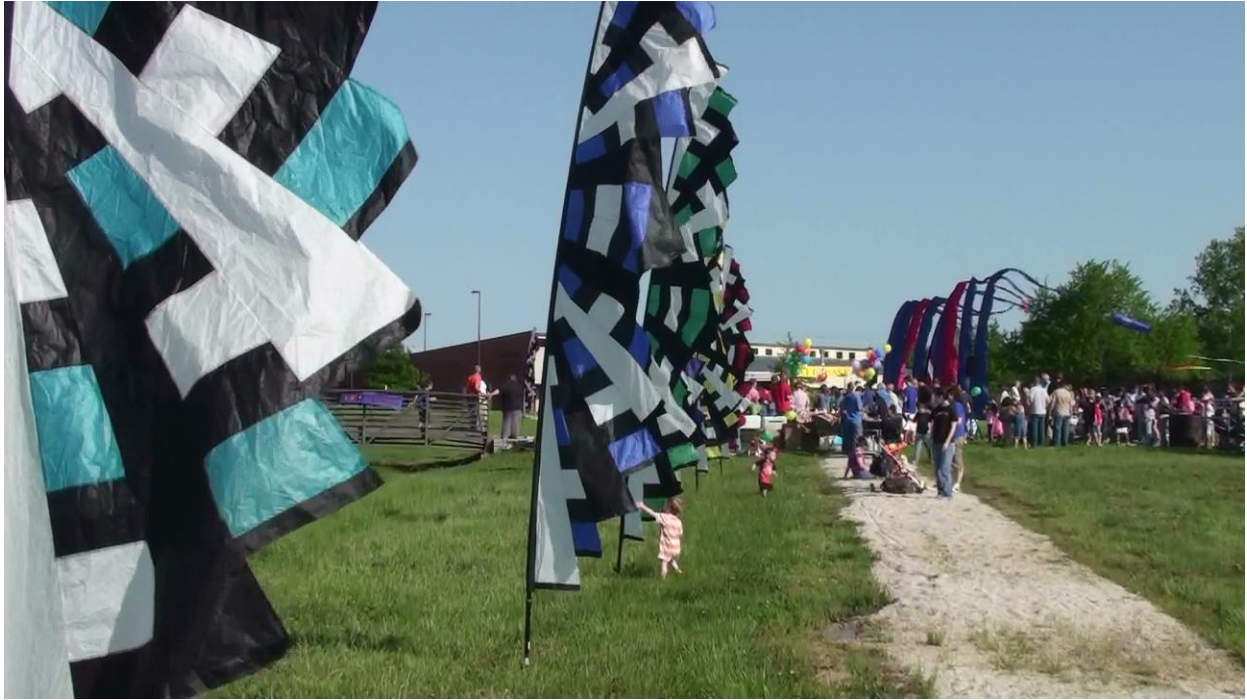
Above, Iola Safe Base Demo

May 16th, 2009 24th Annual Merriam Turkey Creek Festival KC Kite Club once again provided ground display for the 24th Annual Merriam Turkey Creek Festival. This is a really neat craft event for those of you not familiar with the Festival.