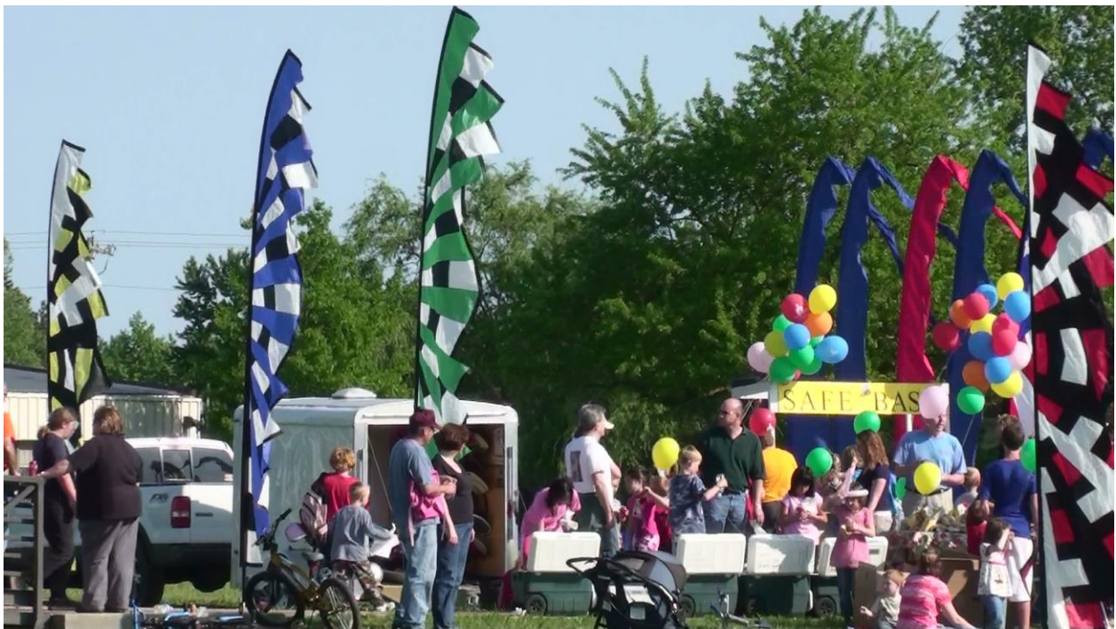
Crowds at the Iola Demo numbered around 500. Wish we had five more MPH of wind!

http://www.iolaregister.com/Local%20News/Stories/Lightbreezegroundskites.html