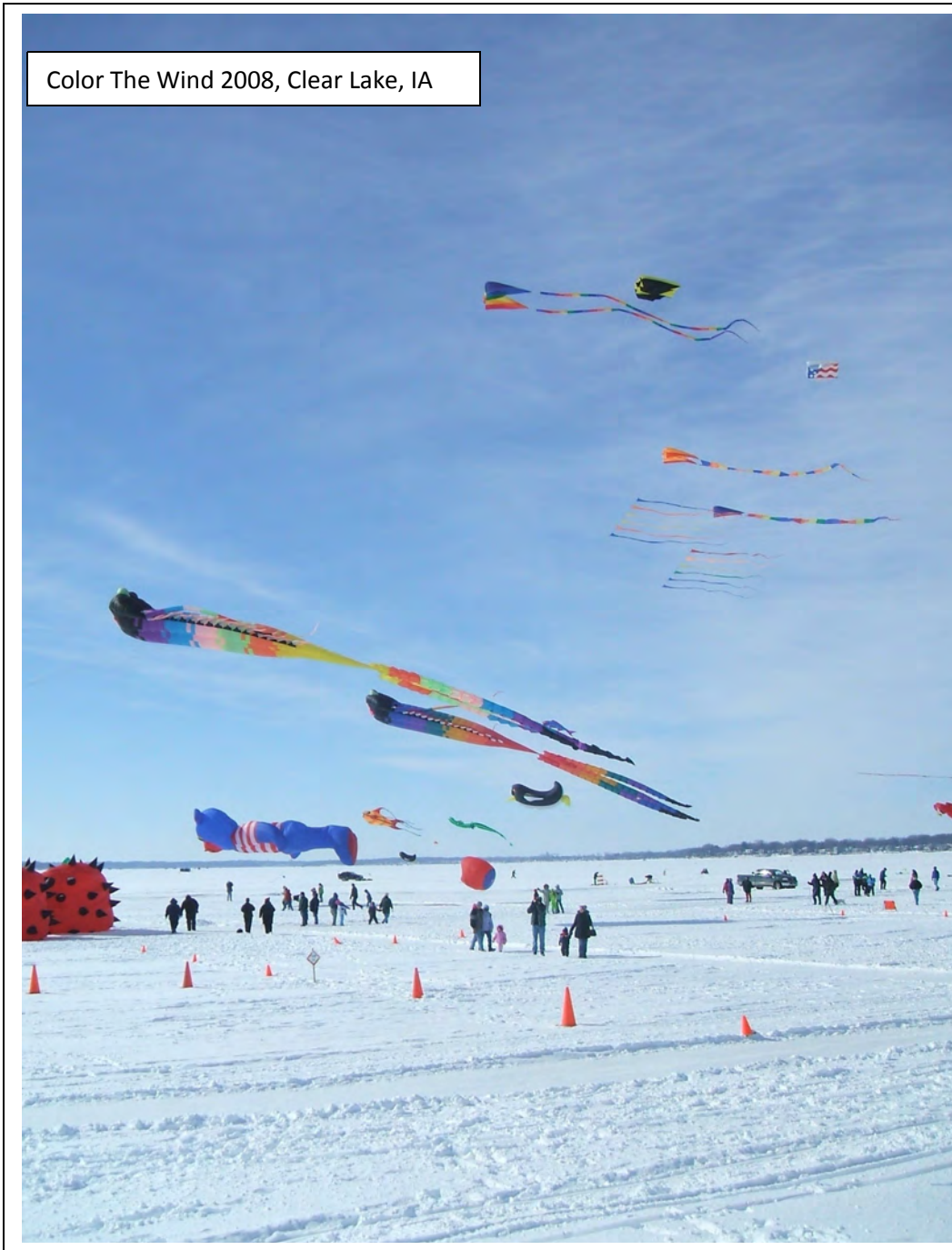
Color The Wind 2008, Clear Lake, IA

4065 Pendent Drive Lee's Summit, MO 64082