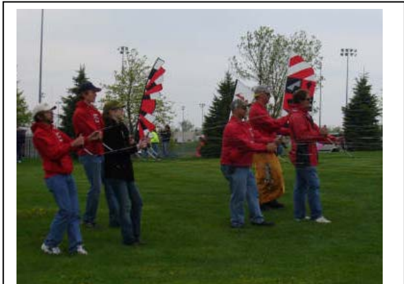
KOG--180GO! Rev Team Performed at Kites Over Grinnell

May 17th 2008 23rd Annual Merriam Kansas Turkey Creek Festival Saturday 10am to 5pm