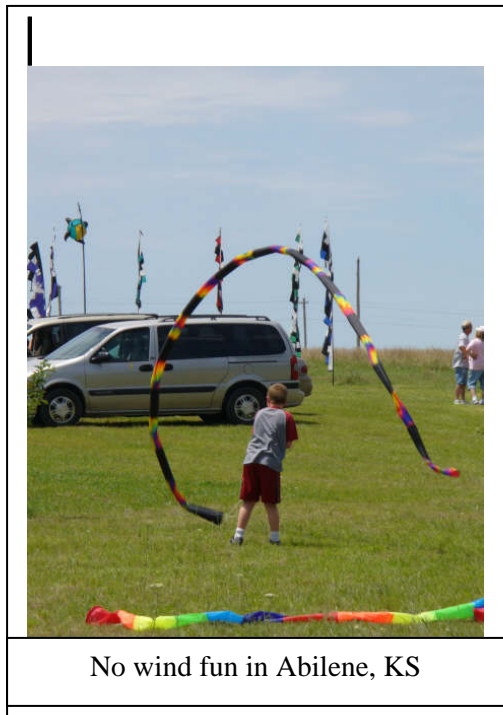
No wind fun in Abilene, KS

has wind, and the one thing we were really worried about was having too much wind.