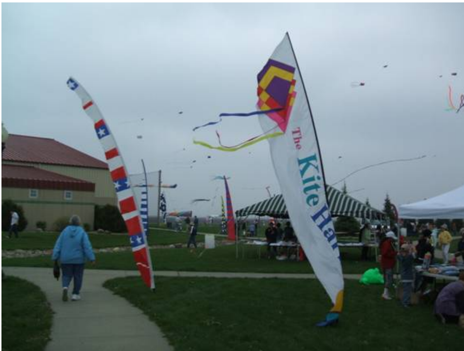
Even for a cold, cloudy, too-windy day, the sky was filled with kites.