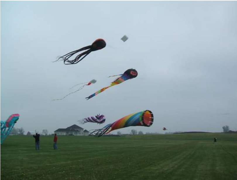
Big kites filled the sky.