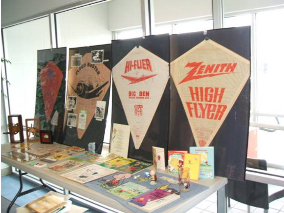
A kite exhibit collected by Tom and Jill Cross.