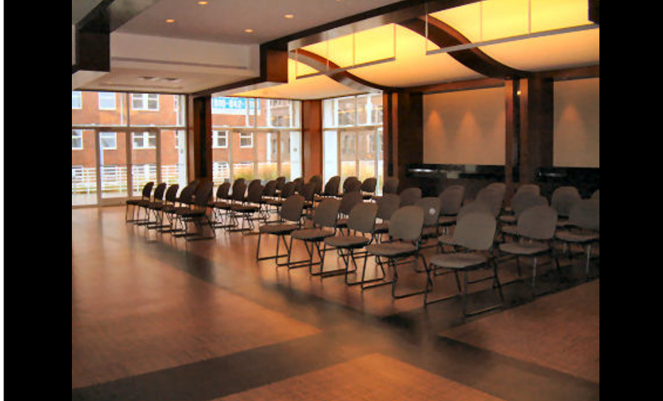
Holiday Party and Auction Meeting Room for 2006(with outdoor balcony) 5 th floor location- date February 17 th 2007

Thanks to everyone that helped with this month's submissions, photos and articles. As a reminder any member can submit an article or idea for this monthly communication tool the KCKC uses. We would love to have your contribution.