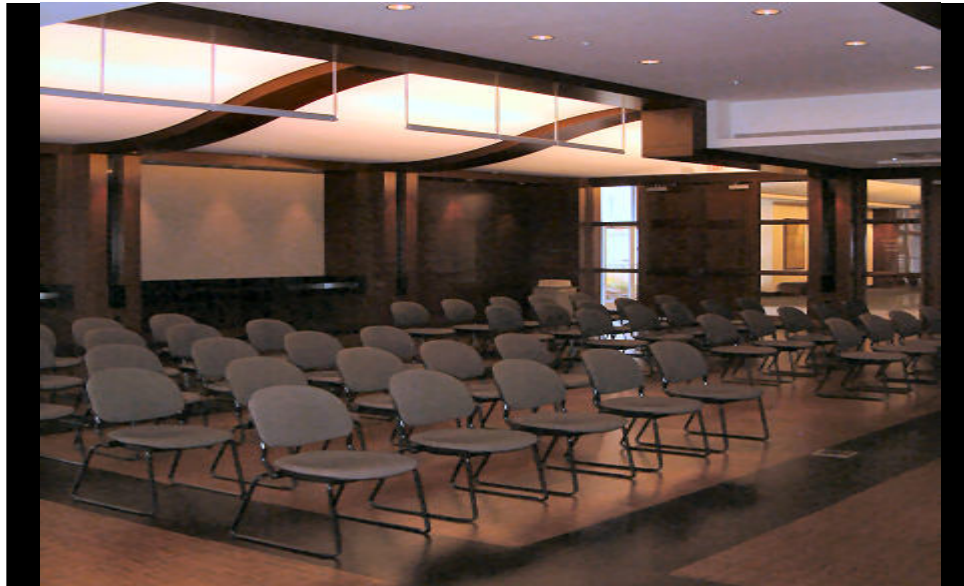
Holiday Party and Auction Meeting Room for 2006 (with outdoor balcony) 5 th floor location- date February 17 th 2007