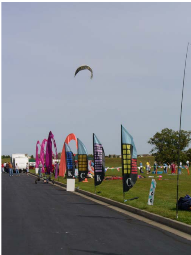
Many folks visited the KCKC tent and flying field located on the east side of the grounds to see the wonderful displays and kites.