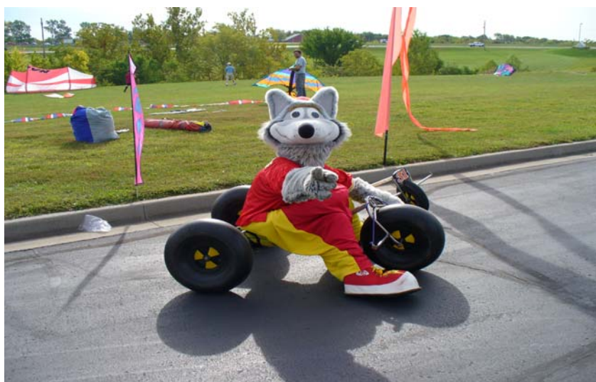
KC Wolf really wanted to buggy at the festival. I wonder if he will ever buggy at the Chiefs game during halftime?