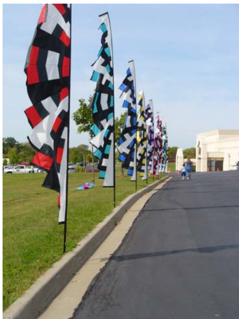
The entire grounds were decorated with tons of KCKC banners!