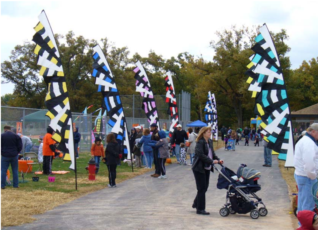
The crowds were steady all day long.