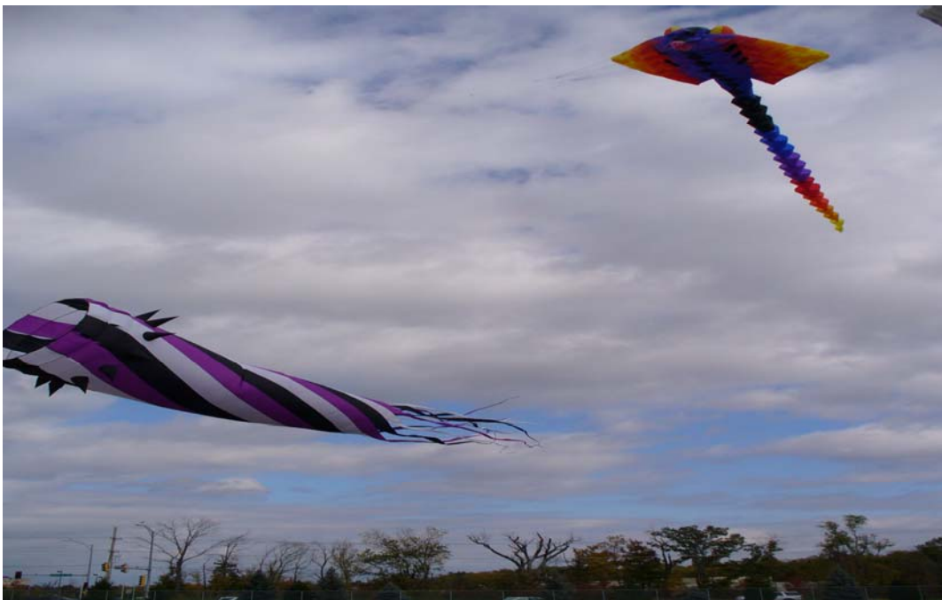
The Manta Ray and the giant spin sock were able to get up about 250 feet attracting a large amount of walk in visitors to the event.