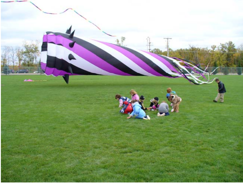
Kids at the event were treated to a candy drop with help from the Gilsons.