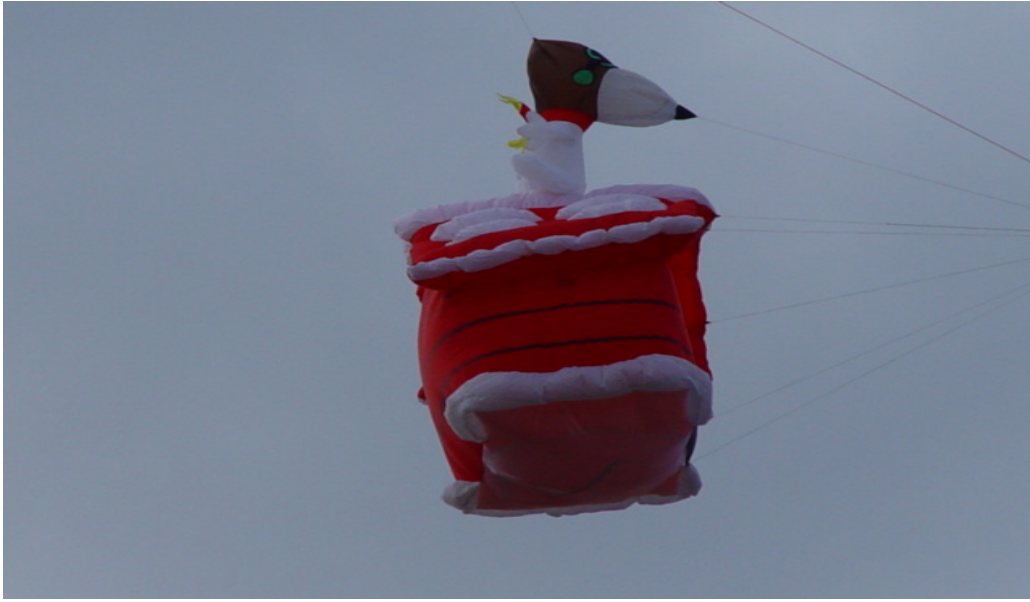
Snoopy fly all day at the Pumpkin Patch thanks to Don Larkie helping him get positioned over the Patch. Thanks Don!