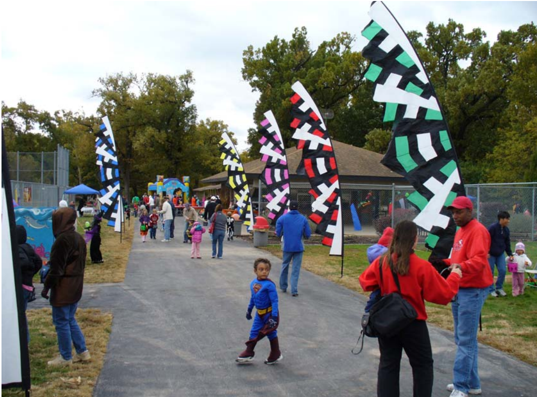
Many spectators witnessed the KCKC displays and kites all day at the Pumpkin Patch. Superman was there and he seemed to get a kick out of the kites.