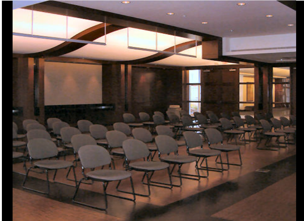
Holiday Party and Auction Meeting Room for 2006 (with outdoor balcony) 5 th floor location- date February 17 th 2007