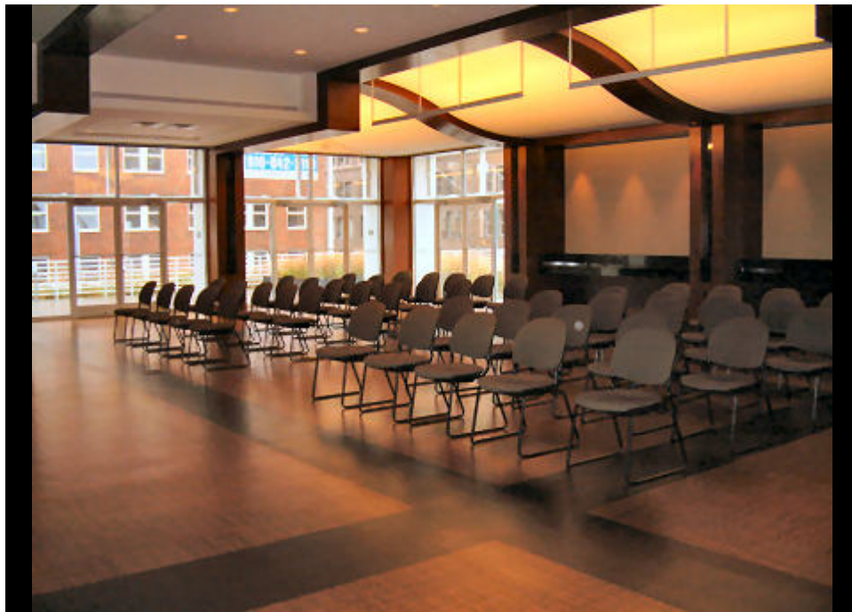
Holiday Party and Auction Meeting Room for 2006(with outdoor balcony) 5 th floor location- date February 17 th 2007